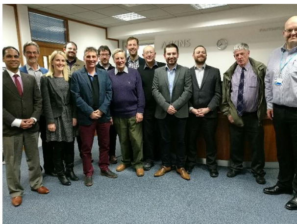
Committee members at Atkins, Stockton, April 2017

On behalf of the CIHT NE&C committee, may I thank the Teesside Sub-Group for their hospitality.